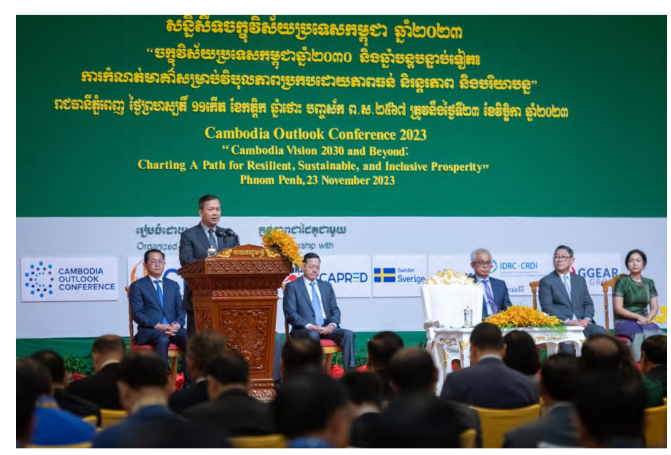
Cambodia Outlook Conference 2023 at Sokha Phnom Penh Hotel on November 23, 2023.

😤 Home - Uncategorized - Cambodia Eyes 2030 Sustainability through Enhanced Private Sector Investment: Insights from CDRI 2023 Outlook Conference