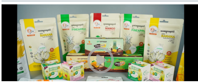
MISOTA: Transforming Local Agriculture to Global Gastronomy